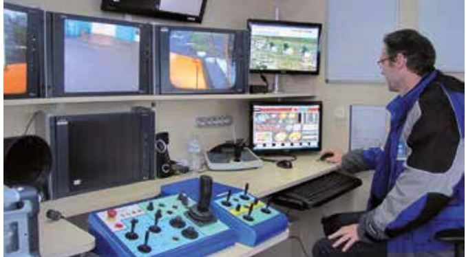
3G control post fitted to a utility vehicle