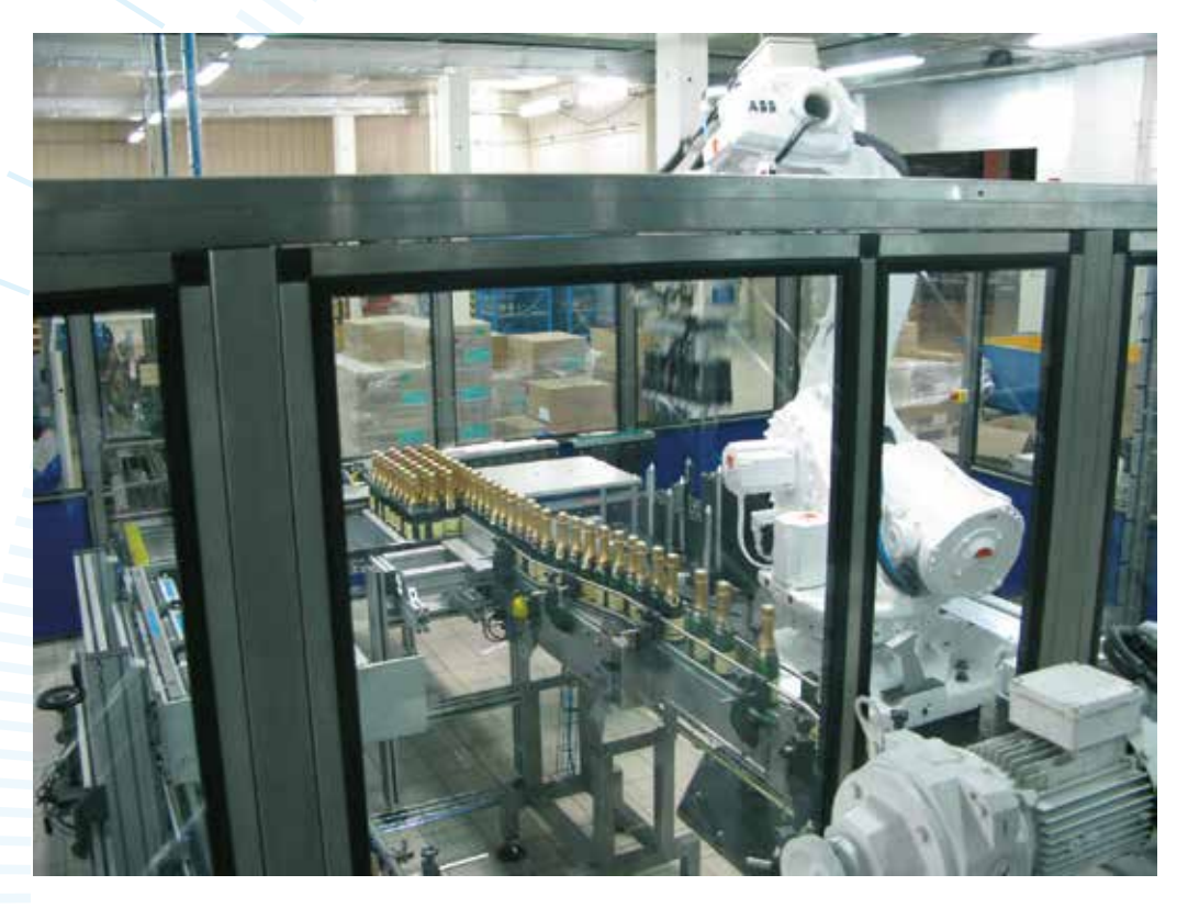
Bottle preparation and packaging: 9,000 bottles/hour