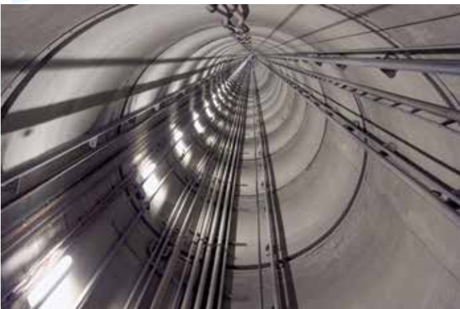
Well of access to the Andra underground Research laboratory - 490 m of depth.

The center has entered a monitoring phase that will last several centuries.