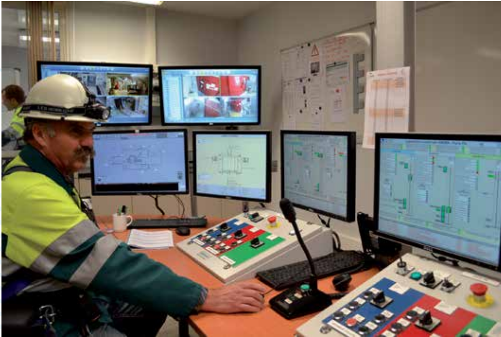
CCS : Andra Control-Command Station using Panorama SCADA software.

“ Our goal is to have a stable, maintainable system. We need a reliable solution for our critical site ”