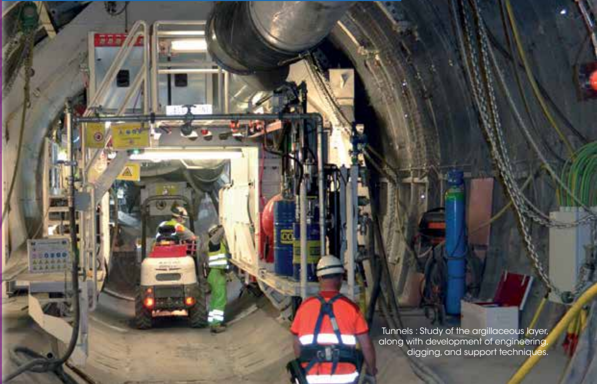
Tunnels : Study of the argillaceous layer, along with development of engineering, digging, and support techniques.