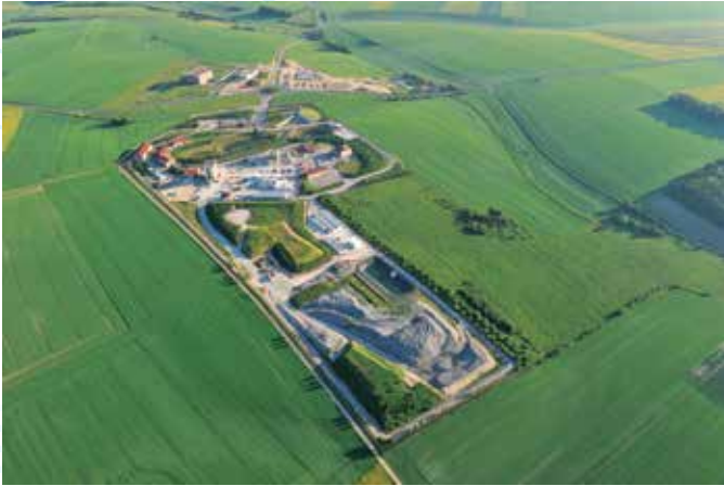
Bird's-eye view of the Andra site: Underground laboratory for testing the storage of radioactive waste.

The Panorama SCADA solution is also installed at Andra sites in the Aube and Manche regions.