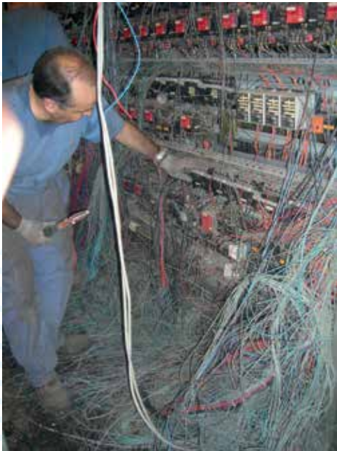
Dismantling of the LV room