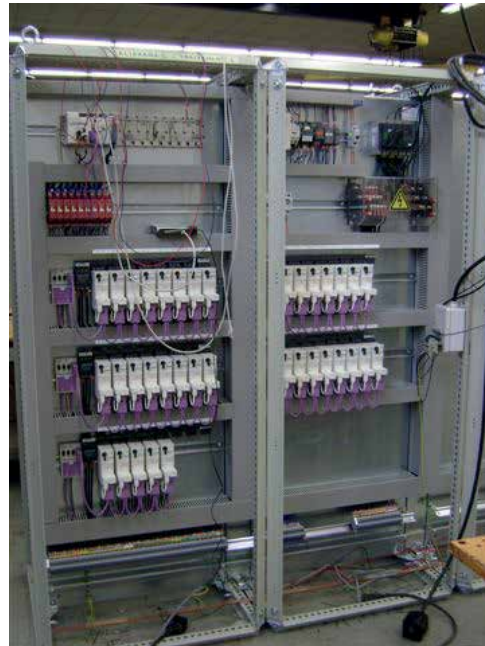
Renovated LV room

“The Panorama E 2 solution meets all requirements, including the ability to develop programs using an object-oriented language with an open, scalable and maintainable system. It integrates agricultural production parameters.”