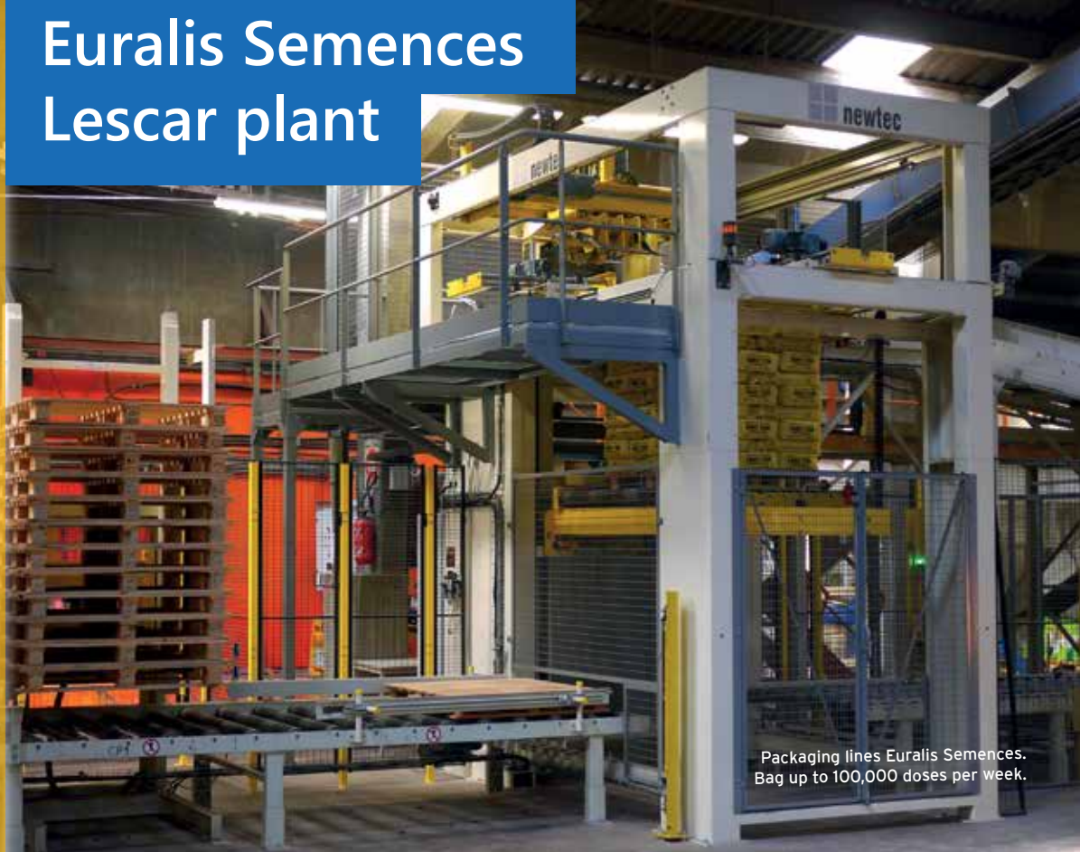
Packaging lines Euralis Semences. Bag up to 100,000 doses per week.