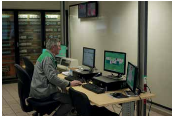
New remote control room