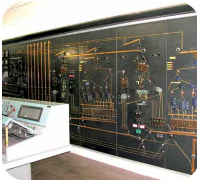
Former manual control room

Following this success, the Euralis Agricultural Products and Distribution Division chose the Panorama SCADA solution for a cereal plant, and recommended it for the renovation of the centralized technical management system at the head office, also based in Lescar.