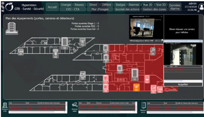
Remove any doubts about your alarms