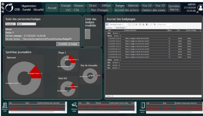
People tracking and badge use history